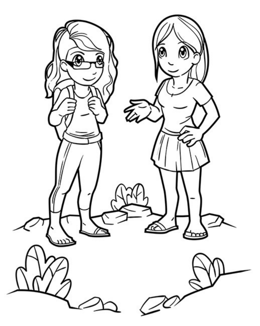
"The wise man learns by listening." (Proverbs 21:11 TLB)