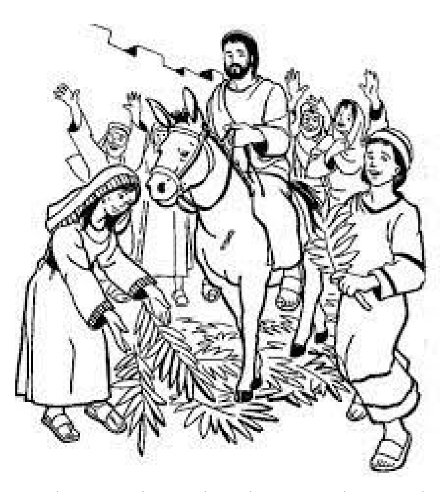
The people took palm branches and went out to meet Jesus shouting, "Hosanna!" (meaning "Save us!") (John 12:13)