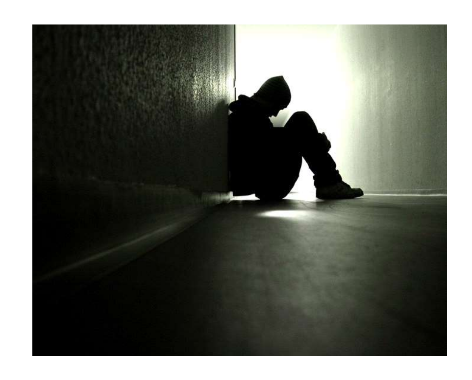
"Rejoice in the Lord always. I will say it again: Rejoice!" (Philippians 4:4)