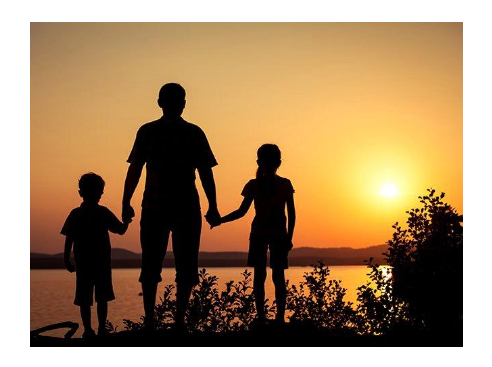
To the faithful You show yourself faithful. (Psalm 18:25)