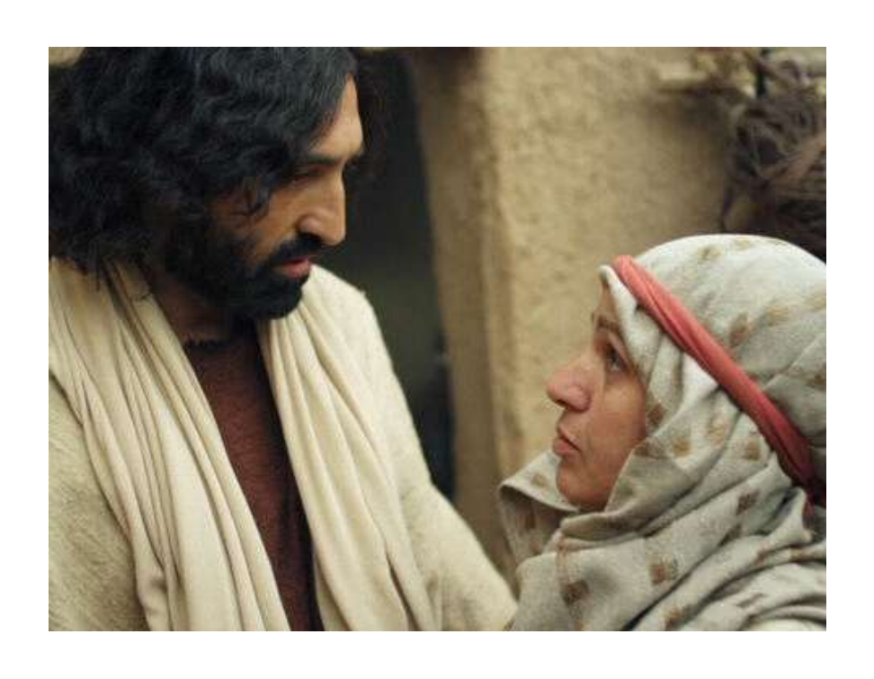
"Yes, Lord," she said, "but even the dogs eat the crumbs that fall from their masters' table." (John 5:6)